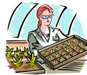
Nursery, Sod, Greenhouse