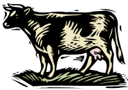
Livestock (cattle, pigs, sheep, dairy, etc).

2. In the past three years, has anyone in your household had a job working with any of these products on a farm, in a field, in a greenhouse, in a nursery, or in a factory? Please circle all that apply.