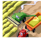
Crops (wheat, corn, soybeans, etc.)