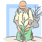
Trees, Timber, Plants, Flowers